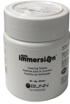
TABLET, CLEANING 1 JAR SURE IMMERSION