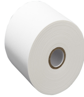
FILTER, PAPER 1 ROLL