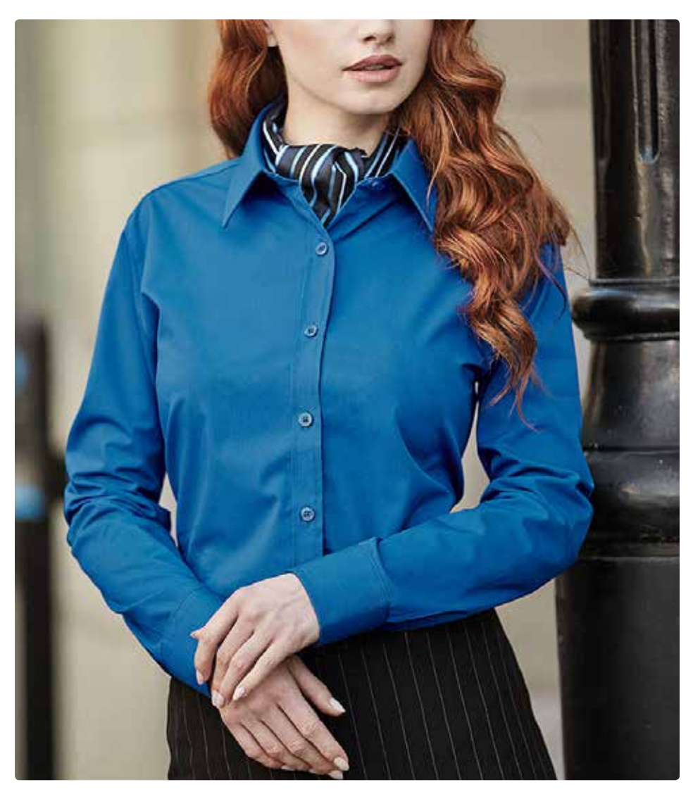
Women's Flex Shirt Regular fit, no pocket, long sleeves, adjustable cuffs, 61% polyester, 36% cotton, 3% spandex, washable.