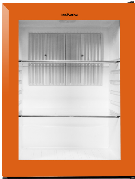
Vib ARCH FIRE